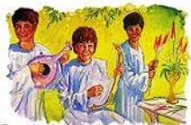
Everybody in God's eternal kingdom will keep the Sabbath holy.

Consider the statement in Acts 5:29; Then Peter and the other apostles answered and said, we ought to obey God rather than men.